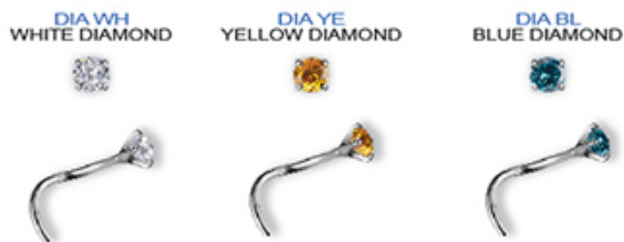
PT950-NSCDC-RD PLATINUM 950 JEWELLED NOSE STUDS SET WITH LAB CREATED DIAMONDS