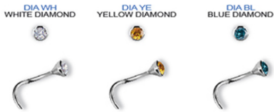
PT950-NSCDC- PLATINUM 950 JEWELLED NOSE STUDS SET WITH LAB CREATED DIAMONDS