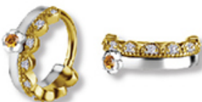
PT950-HSRC94-1610 PLATINUM 950 AND 18K GOLD HINGED SEGMENT CLICKER SET W. CREATED DIAMONDS GAUGES ① LENGTH / Ø ② 16ga (1.2mm) 10mm