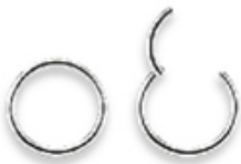
PT950-HCR- PLATINUM 950 HINGED SEGMENT RING