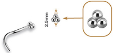
PT950-NS3BC-2.5 PLATINUM 950 TRINITY BALL NOSE STUDS GAUGES ① LENGTH ② HEAD SIZE ③ 20ga (0.8mm) 6.5mm 2.5mm