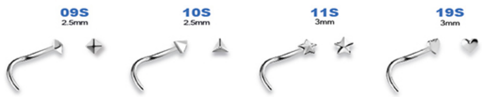
PT950-NSXC- PLATINUM 950 NOSE STUDS GAUGES ① LENGTH ② 20ga (0.8mm) 6.5mm